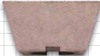
← 15 1 / 4 " X 8" X 8" SOLID TRAPEZOID CAP BLOCKS