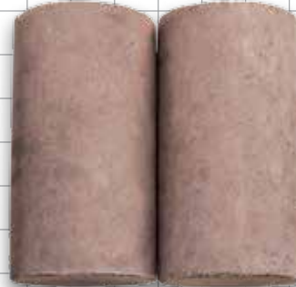
← 6" X 12" SOLID, SINGLE-HOLE AND DOUBLE-HOLE CYLINDERS